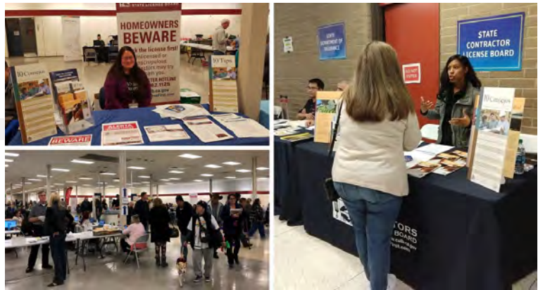
Disaster Warning Signs